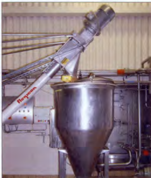
The flexible screw conveyor moves the free-flowing raw material 4.5 metres at a 45-degree incline into a hopper.

The forklift operator positions a bulk bag in front of the discharger frame and attaches it, via straps, to an electric hoist that lifts the bag above the receiving hopper. A Spout-Lock clamp ring positioned above a pneumatically activated Tele-Tube telescoping tube enables the operator to make a quick, dust-tight connection between the bag spout and hopper.