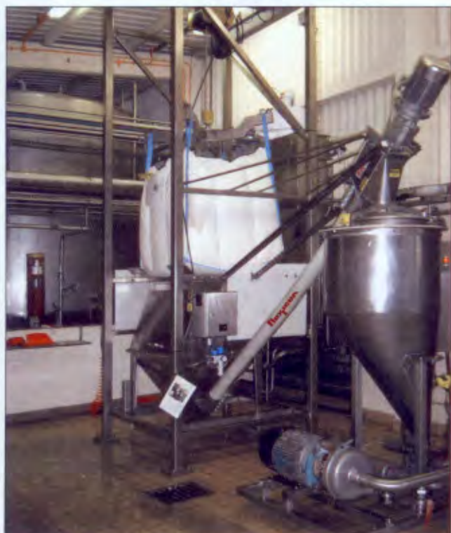
The new bulk bag discharger system at Danisco covers a small footprint while reducing costs and waste.

As a solution, Danisco installed a Flexicon bulk bag discharging system that conserves plant floor space and reduces costs, waste and dust while improving plant hygiene along with worker health and safety.