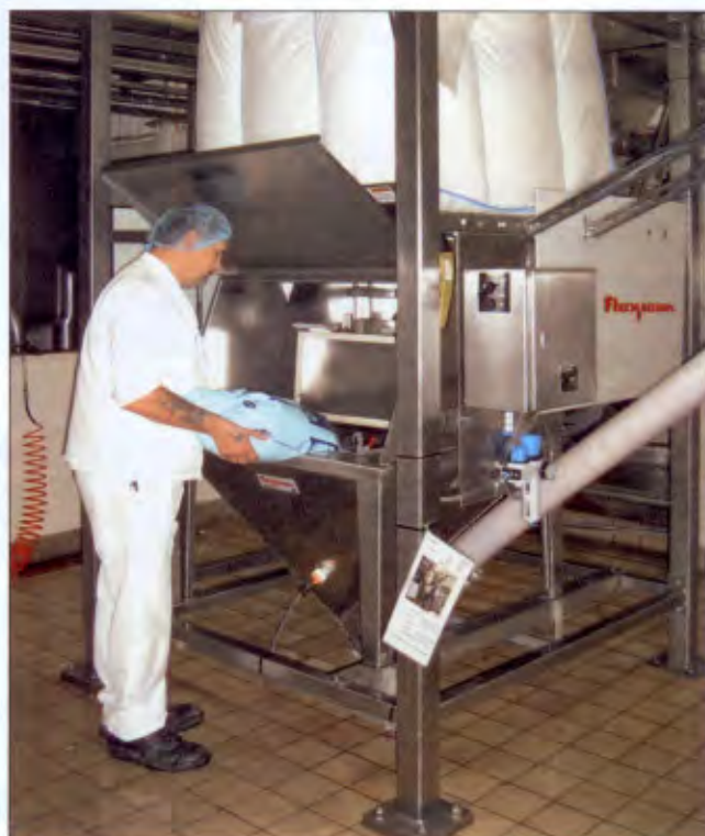
The new bulk solids handling system has contained dust and reduced injuries related to manual bag handling.