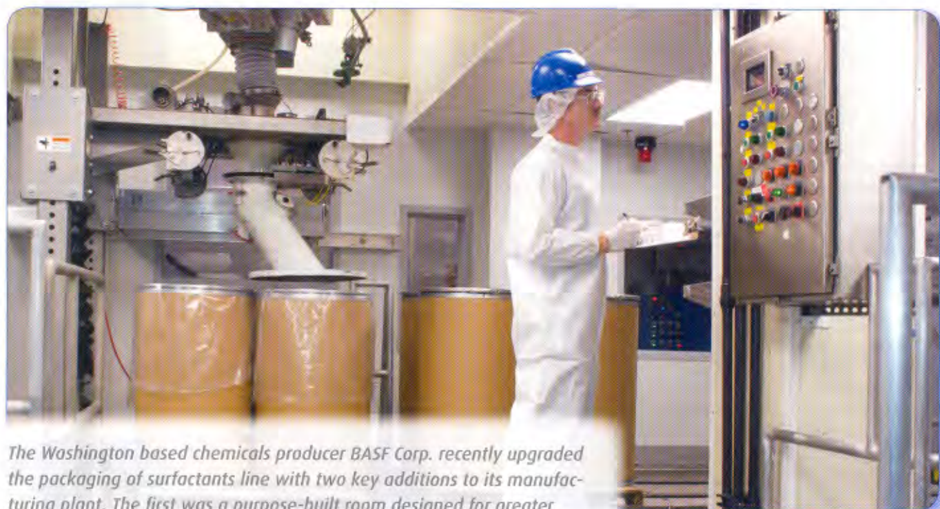
Fig. 1: PLC communicates with weigh-filler scale to control product flow. Four drums await filling as four are about to exit the room.

The Washington based chemicals producer BASF Corp. recently upgraded the packaging of surfactants line with two key additions to its manufacturing plant. The first was a purpose-built room designed for greater cleanliness and control in loading surfactants into drums and bulk bags prior to shipping. The second was the installation of a rotating drum and bulk bag filler system from bulk solids handling specialists Flexicon Corp. This plant automates the process and yields greater product output and quality control than the previous method of manual loading.