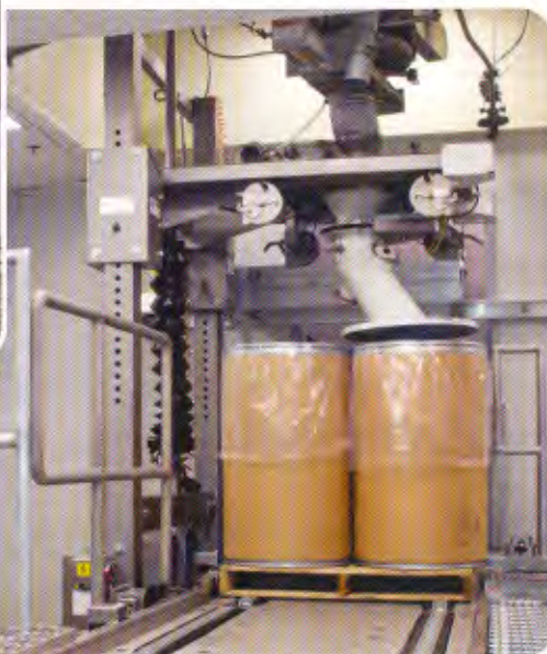
Fig. 4: Filled drums are conveyed from loading room to shipping area.

When filling a bulk bag, an operator attaches the four bag straps to each corner of the loading frame, engages the bulk bag fill spout to the fill head utilizing an inflatable collar to provide a dust tight connection and puts the bag into a rubber bladder, which seals the surfactant in the bag after product is loaded, and acts as an extra layer of protection during transport. The frame rises to accommodate the height of the bag as it rests on a pallet atop the weigh-filler scale, which has a 2.3 sq. m foot print. The scale transmits weight data to the PLC, which automatically stops the flow of material when the correct weight of surfactant has been loaded. The bag is then closed and moved on the roller conveyor to the shipping area.