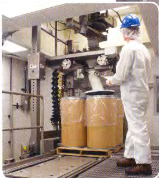
Fig. 2: Automated drum filler utilizes an indexing diverter head to fill four 208L drums sequentially with surfactant powder gravity fed from rotary valve at top. The system can also be configured for loading 2000 lb (907 kg) bulk bags.

When filling drums, the operator attaches the automatically rotating drum fill adapter to the Flexicon bulk filling station. Once the four drums have been positioned on the deck of the filling station, the operator presses a start-up button on the PLC and surfactant begins flowing. Each drum has a plastic lining into which the surfactant flows. When one drum fills, flow is interrupted while the diverter head indexes to fill the next drum in sequence. Once all drums are filled, the operator seals the liners, and puts lids on the drums which are then transported via conveyor from the purpose-built loading room into the shipping area.