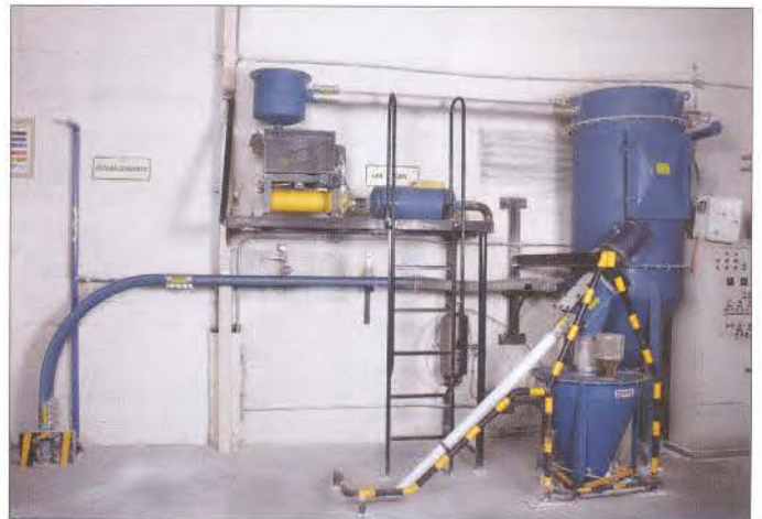
Two pneumatic lines convey PVC from the ground-floor bulk bag unloader unit to the filter-receiver on the third floor of the Oplex plant.

The screw self-centres as it rotates, providing clearance between the screw and tube wall to prevent grinding of the material. The conveyor is powered by a 3.7kw motor at the discharge end where the CaCO 3 enters the weigh hopper through a transition adapter. Load cells under the weigh hopper permit precise weights of CaCO 3 to be measured. From the hopper, the weighed batch passes through a slide gate valve to the mixer.