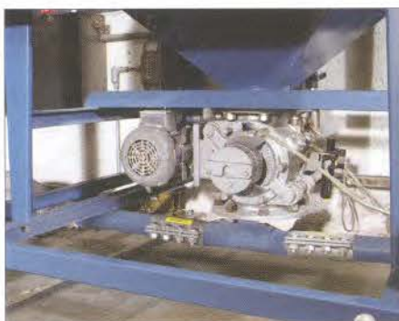
Below the hopper on the bulk bag discharger frame, a drop-through rotary valve meters PVC resin into two pneumatic conveying lines.