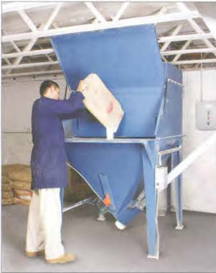
Worker loads calcium carbonate additive into bag-dump station on the second floor of the Oplex plant. The flexible-screw conveyor, located on the right, transports the additive 9m to a weigh hopper on the third floor.