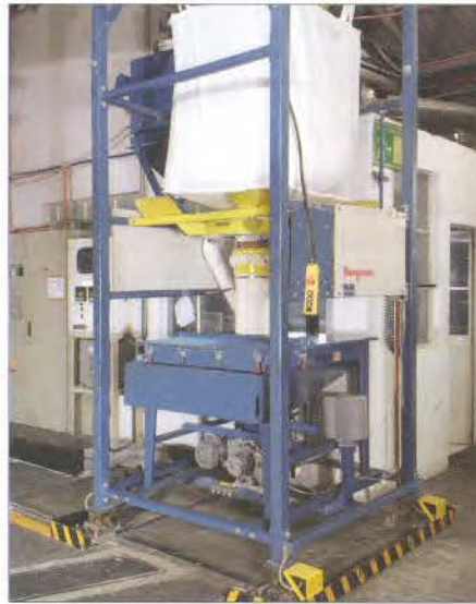
Oplex installed a BFC Series bulk bag unloader from Flexicon to improve the quality and productivity of its PVC compounding operation. Features include a cantilevered I-beam and hoist, Bag-Vac dust collector, Flow-Flexer bag activators beneath the bag for positive material flow, Tele-Tube telescoping tube and Spout-Lock clamp ring at the bag spout interface, hopper, and PLC-controlled rotary valve.