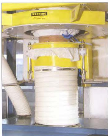
At the bag spout interface, a Spout-Lock clamp ring creates a dust-tight seal while a Tele-Tube telescoping tube maintains constant downward pressure as the bag empties/elongates, promoting complete discharge.