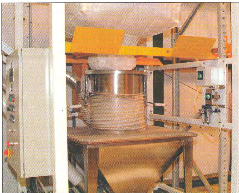
Spout-Lock clamp ring and pneumatically actuated Tele-Tube telescoping tube allow dust-tight connections between bag spout and hopper, and automatic elongation of the bag as it empties for total evacuation of material.