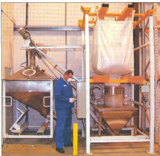
Fully enclosed system, comprised of bulk bag discharger, receiving hopper, flexible screw conveyor, and transfer bin, dramatically reduces operator exposure to airborne dust.