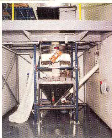
The circular vibratory separator scalps paper pieces from cut bags containing the powdered milk product.

TVS is a non-profit community rehabilitation program providing employment and employment services to adults with disabilities or other barriers to employment. Based on the success of this new line, TVS plans to add a sister unloading and packaging line that will blend milk powder and other ingredients. The system will incorporate another circular vibratory separator and two flexible screw conveyors.