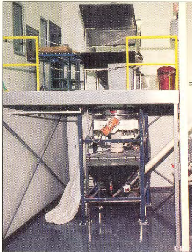
Powdered milk, emptied from bags into bag dump station, flows through 48" diameter circular vibratory screener into a floor hopper, from which the flexible screw conveyor, at a 45° incline, transports the powder to form-fill-seal machine in adjacent room.

Built to 3-A dairy standards, the system operates in a temperature and humidity controlled clean room required for USDA dairy certification. Temperature is maintained between 70°F to 72°F; humidity between 27 to 35% for the dry product (2.5% to 3% moisture). "Moisture over 3% causes trouble for the packaging machinery," Merrill says.