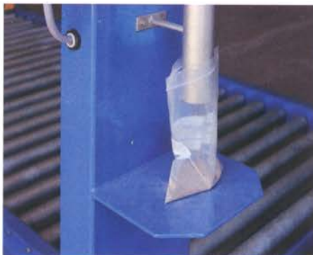
A pneumatically operated product sampler captures a 142 g specimen from the material stream for product quality documentation.