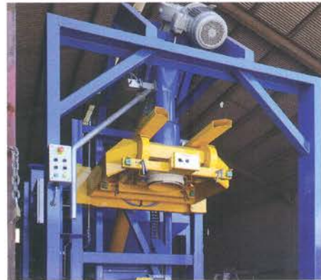
The Swing-Down fill head pivots to a vertical position, allowing the operator to safely and rapidly attach bag straps to filler latches while standing on the plant floor. Pushing one button inflates the material inlet against the bag spout, and initiates all automatic bag filling functions.

"Features like easy bag attachment and no manual handling of loaded bags or pallets minimise worker exposure to potential