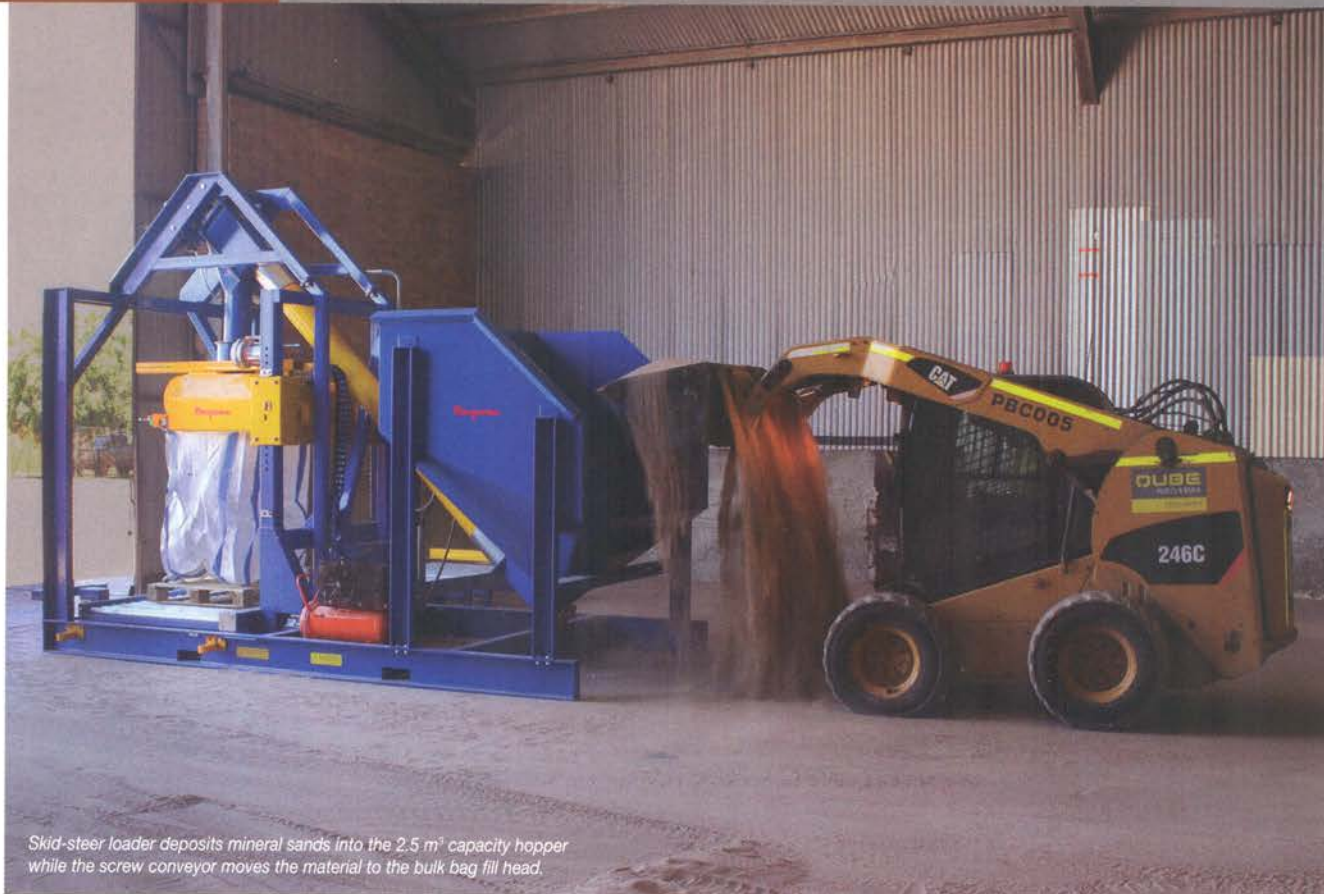
Skid-steer loader deposits mineral sands into the 2.5 m 3 capacity hopper while the screw conveyor moves the material to the bulk bag fill head.

injuries,” Pascoe says. “We were concerned about workers being exposed to dust in the storage sheds, but the filler discharge chute contains all dust.”