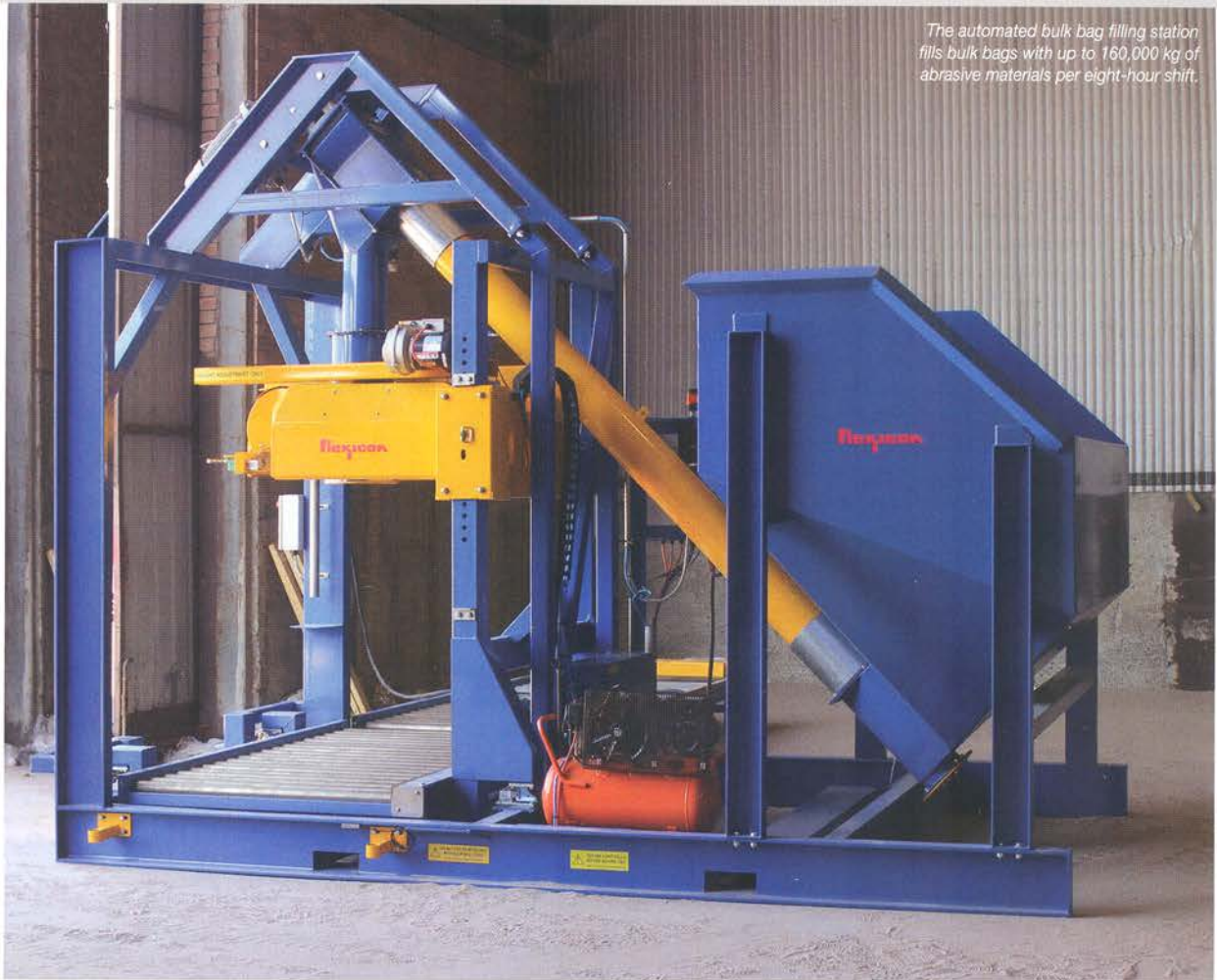
The automated bulk bag filling station fills bulk bags with up to 160,000 kg of abrasive materials per eight-hour shift.

Logistics provider Qube Bulk has installed a Flexicon bulk bag filling system at its site in Picton, Western Australia, for handling abrasive mineral sands belonging to Cristal Mining Australia