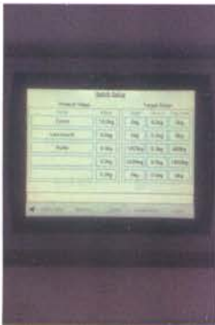
A touch-screen interface on the PLC allows program setup and activation of filling cycles.