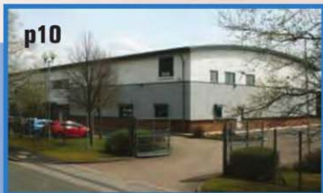
p10 | Kee Connections opens new Northwest facility