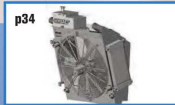
p34 | Tailor-made cooling for mobile machines

OFFICIAL PUBLICATION FOR THE FLUID POWER & SYSTEMS AND AIR-TECH EXHIBITIONS