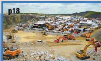
p18 | Hillhead 2016 preview